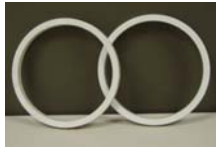
3"-10" PVC Plaster Stop Rings